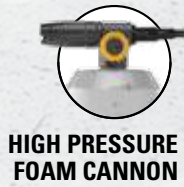
HIGH PRESSURE FOAM CANNON